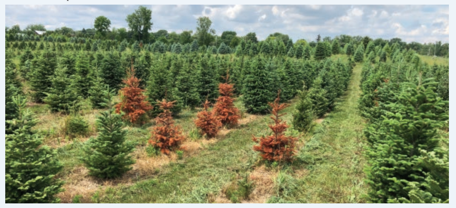
Figure 4. Localized Phytophthora sp. infection in Fraser fir. In the next rotation it is not recommended that any true fir be planted on this site.