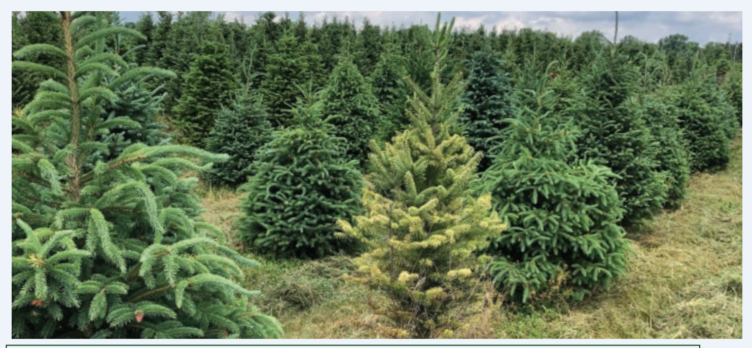
Figure 7. A single Canaan fir planted in a block of Black Hills spruce to evaluate its potential for planting on this site in the next rotation; obviously, Canaan fir will not be planted on this site next time.

This article has attempted to identify the most commonly planted species for Christmas trees in the northeastern United States and adjacent Canada. Additionally, it has endeavored to identify some of the most important site related considerations that should be noted and considered before a particular species is selected for planting. Because the planted species will occupy the selected location for a period of eight to ten years or more, it is important to plant a particular species where the opportunity for success is the greatest (Figure 6). Every Christmas tree farm