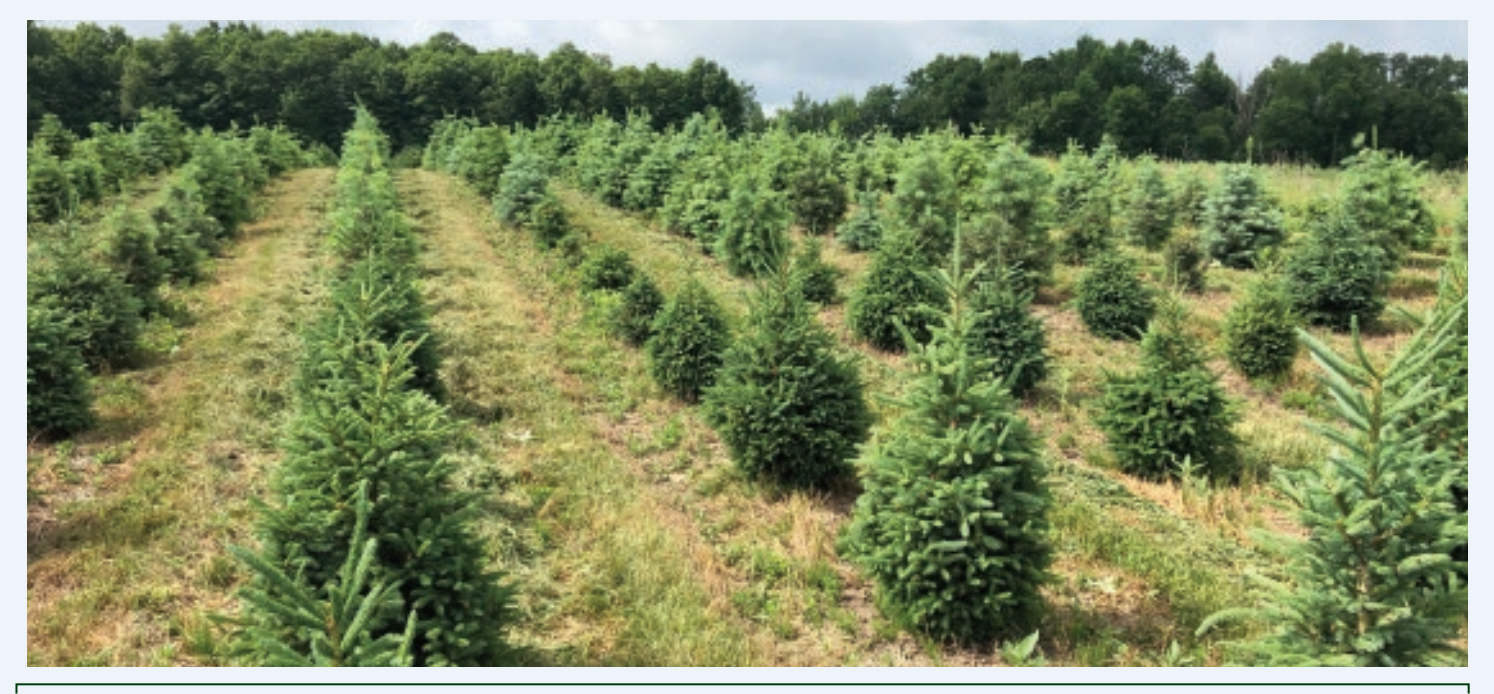
Figure 6. Black Hills spruce in the foreground growing on a low-lying but well drained site. In the background are Concolor fir growing on an upland area of clay-loam soil.

Douglas-fir of Rocky Mountain origin (variety glauca ) has been widely planted in much of the northeastern United States. In recent years popularity of the species has decreased among growers due to two widespread needlecast diseases. These are identified as Rhabdocline and Swiss needlecast. With some difficulty, these diseases can be controlled through annual repeated applications of effective fungicides. Because popularity of the species among consumers continues in some areas of the Christmas tree region, it continues to be planted by some