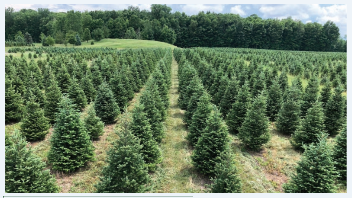
Figure 3. Excellent stand of seven-year-old Fraser fir growing on a sandy loam soil.

Fraser fir (Abies fraseri) is the most popular Christmas tree species in the eastern United States and adjacent Canada. It is highly prized by consumers and for this reason is widely planted by growers. Quality trees are valued for their density, symmetry, and fragrance. However, one of the most desirable traits is its excellent needle retention during the display period. When planted for Christmas tree production, it is considered as one of the most site demanding species if maximum quality and productivity is to be realized. When site conditions are ideal it is easy to grow and trees of