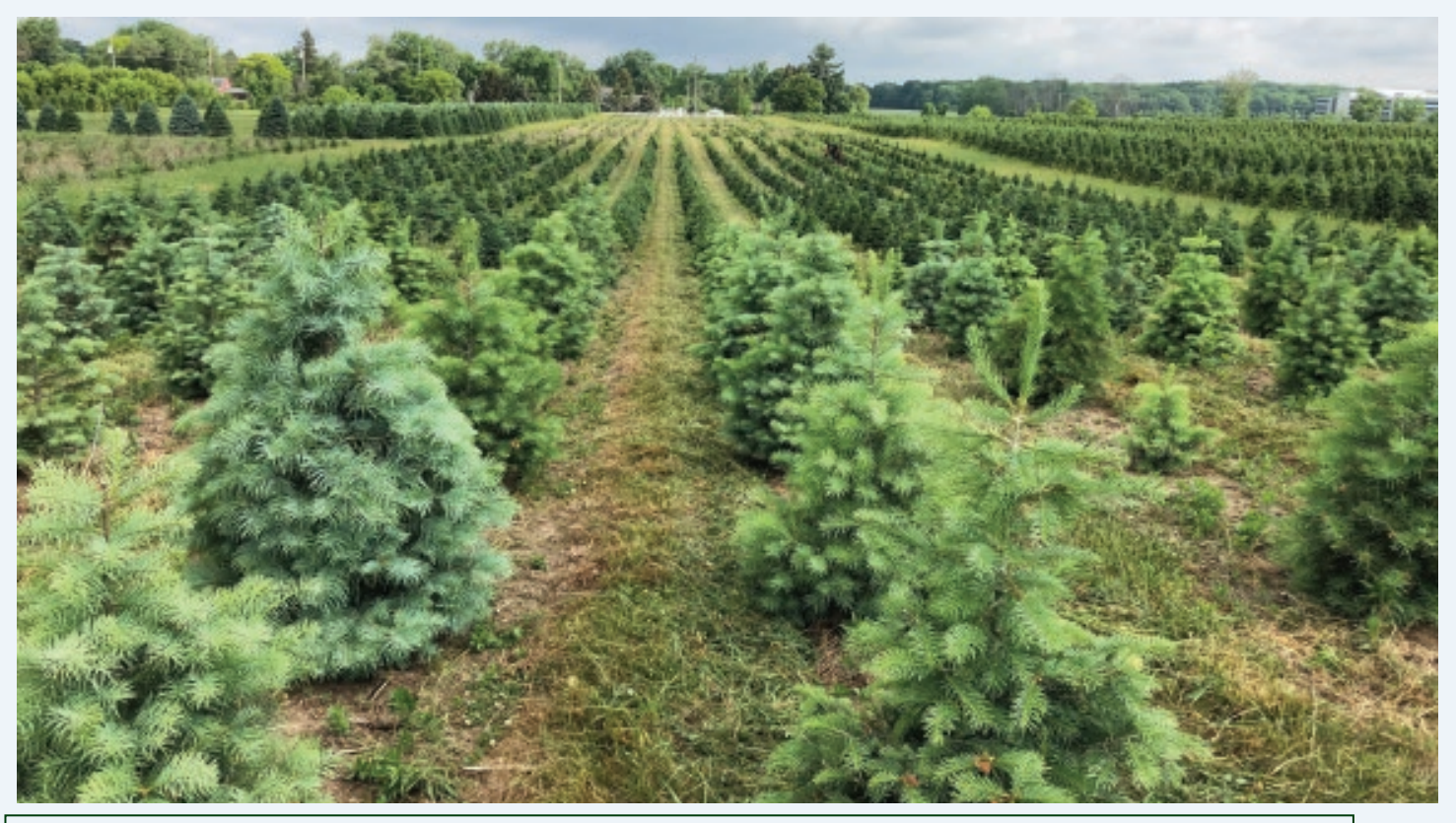
Figure 2. Concolor fir growing on a small hill in an otherwise mostly Fraser fir plantation. The small difference in elevation allows Concolor to avoid damage from late spring frosts.

All Bracted Balsam fir is NOT Canaan fir. Canaan fir is Bracted Balsam fir, the seed of which is collected from trees in the Canaan Valley of West Virginia, or from seed orchards of established trees that were started from seed collected from selected trees in the Canaan Valley. The climatic and topographic features of the Canaan Valley make it unique, thus the native vegetation has some unique characteristics. The elevation of the Valley is some 3200 feet above sea level. Average summer high temperatures are in the 70's F., and average winter snowfall is approximately 130 inches. The length of the typical growing season is approximately 95 days. It is from this region that