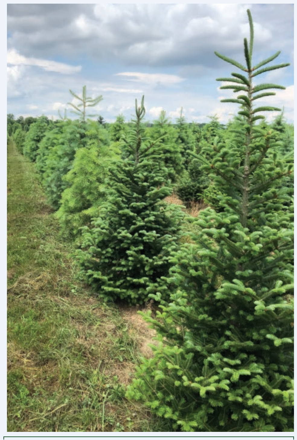
Figure 8. Changing species in the same row to accommodate a change in site. Due to slight changes in elevation and soil type, Concolor fir has been planted in place of Fraser fir since it is better adapted to the change in site.

Undoubtedly all individual species characteristics have not been identified. Likewise, all possible site variations have not been described. Growers are advised to evaluate the suitability of a particular site for a different species, by planting a few trees of the new species at various